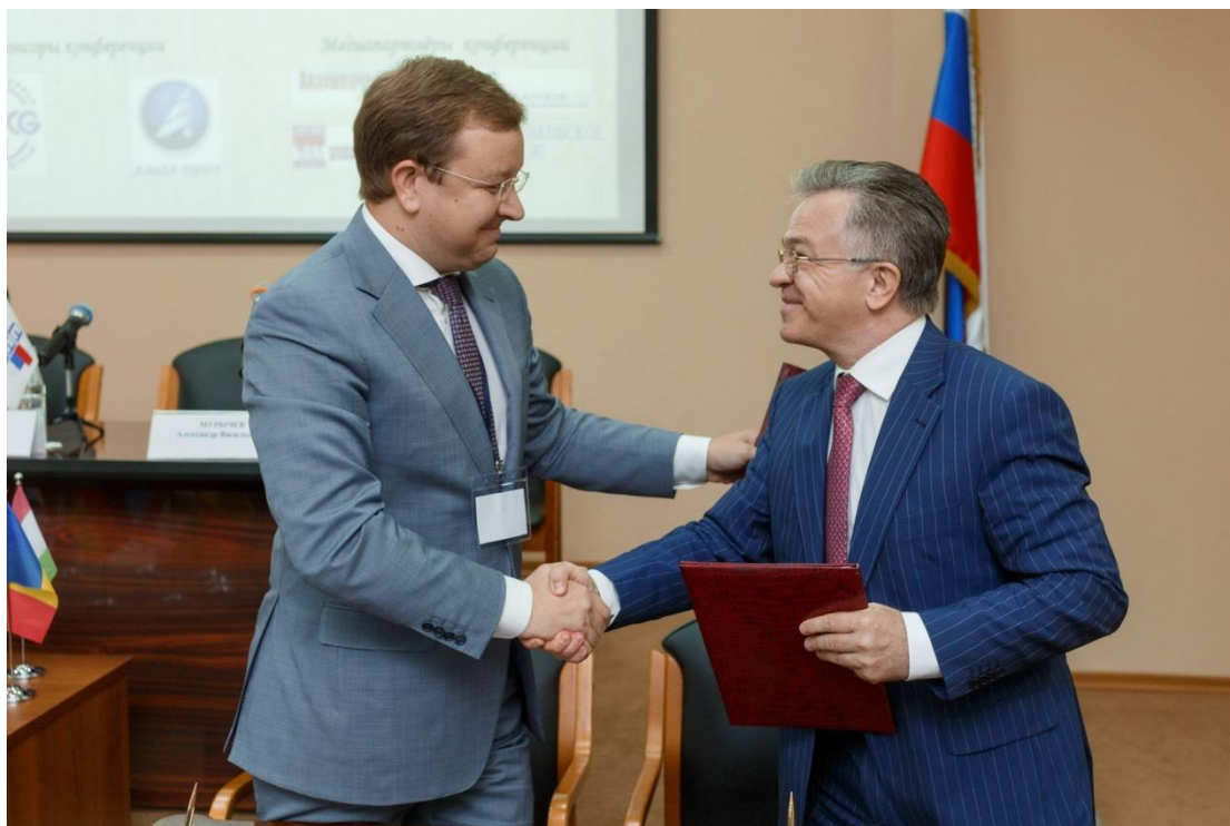
Memorandum on cooperation with the Perm region